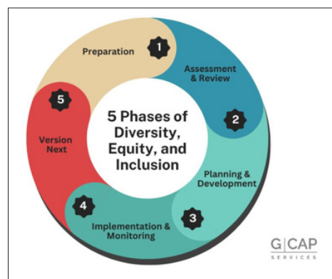
Figure 1: Implementation Steps – DEI

In essence, the pivot from a project-centric to a program-centric approach in D&I signifies transitioning from achieving milestones to cultivating an environment where diversity and inclusivity permeate through every interaction, decision, and strategy, fortifying a truly inclusive, equitable, and vibrant organizational culture. This shift is instrumental in ensuring that D&I efforts are not transient, but sustainable, impactful, and inherently aligned with the organization's continuous evolution.