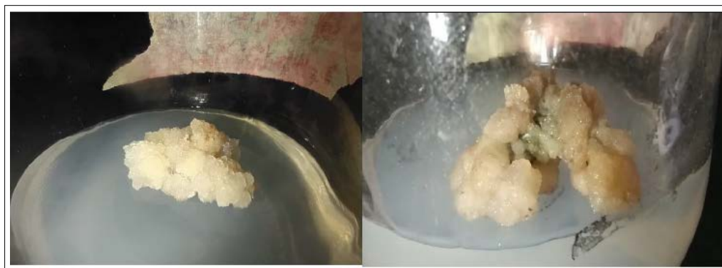
Figure 2: Light white to yellowish friable callus produced in vitro cultured leaf explants of Catharanthus roseus at MS medium with BA 0.3 mg/l and 2,4-D 0.75 mg/l hormonal combination.