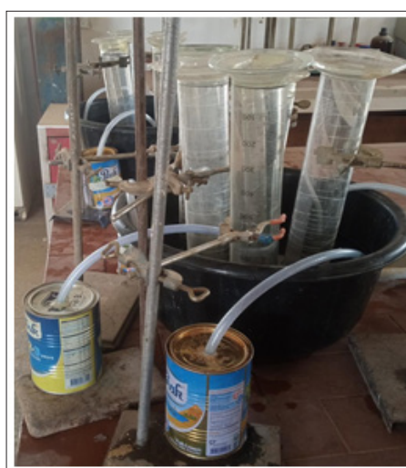
(d) Figure 5: A Biogas Plant Setup