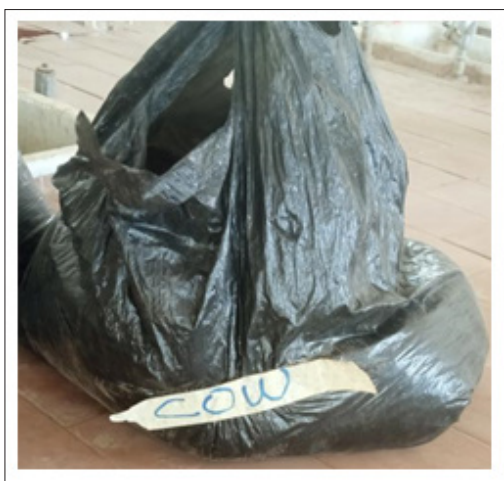
(a) Figure 2: Cow Dungs Substrate

Results are Expressed as Mean \pm Standard Deviation, Means with the Same Letters are not Significantly Different ( P < 0.05 )