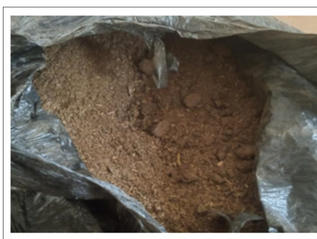
(b) Figure 3: Cow Dungs Substrate