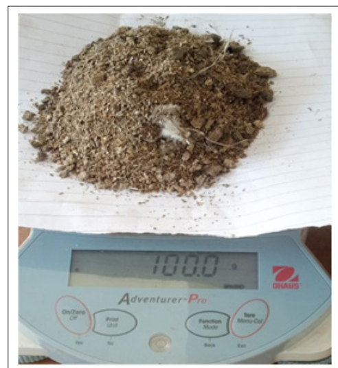
(c) Figure 4: Weighing of Cow Dungs Substrate