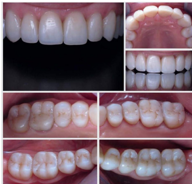
Figures 12 and 13: Appearance of Teeth Restored with Composite, Three Years after Replacement of Restorations

Immediately after the restoration, patients are obliged use caps that isolate the upper and lower teeth between each other during the clenching of the teeth as a result reaction to stress. We usually make it first three caps: night guard, day guard and spare, but, if necessary, their number can be increased.