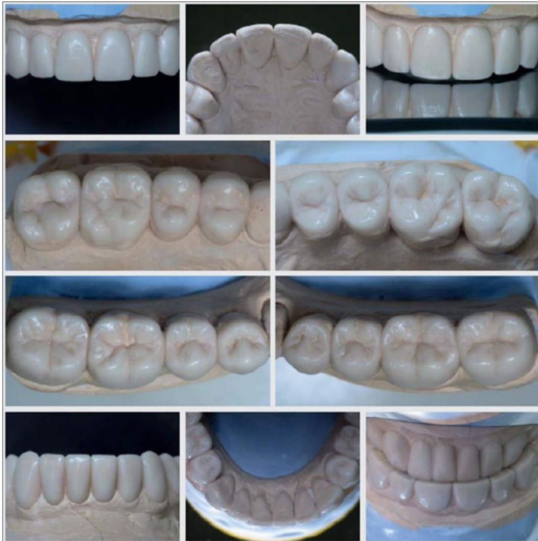
Figures 5: Wax modeling of teeth