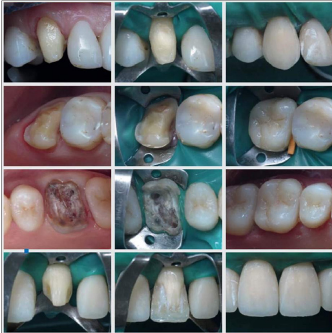
Figures 7: Replacement of Restorations in The Upper Teeth

Examples of the use of spatial guidelines when replacing restorations in upper teeth.