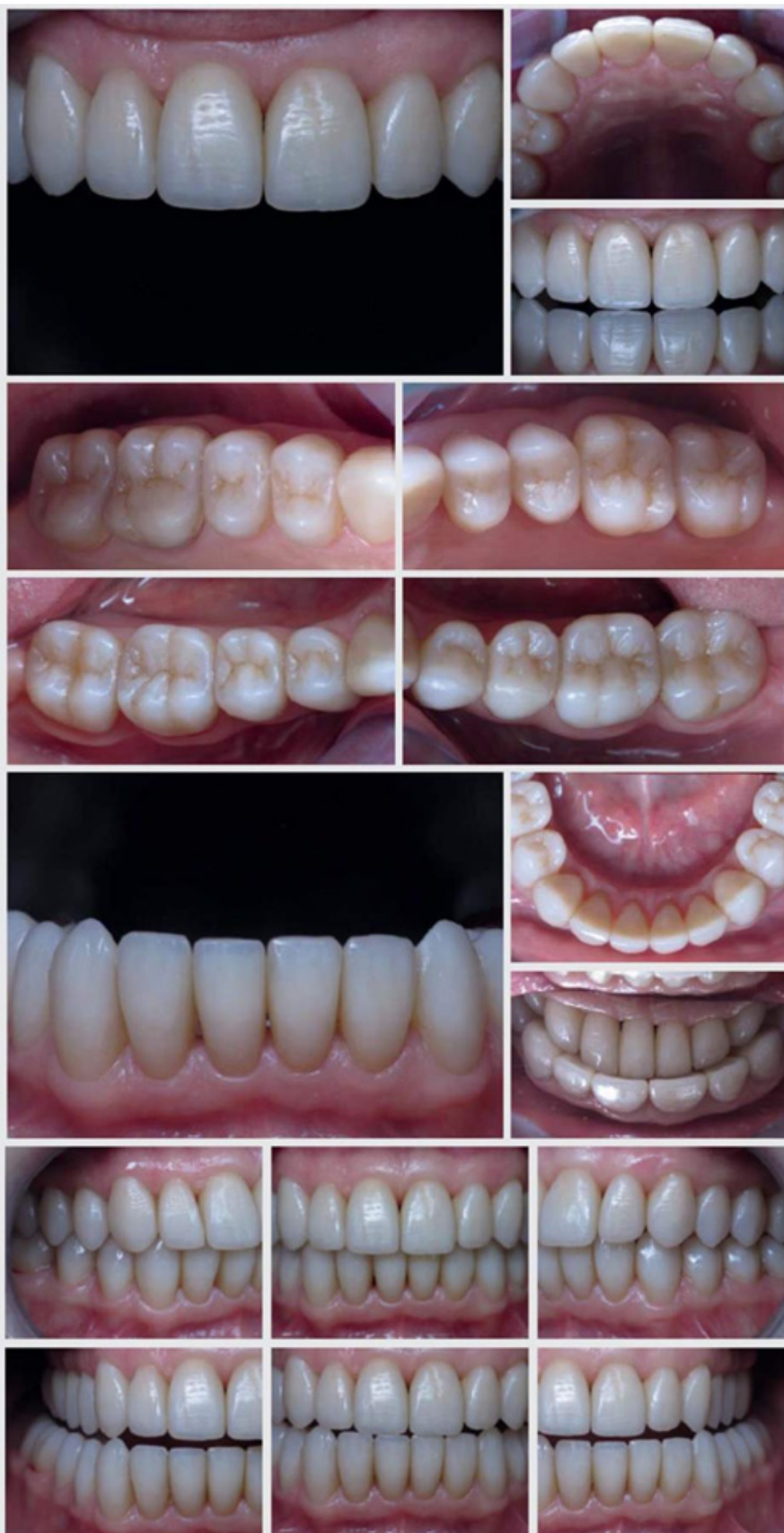
Figures 9 and 10: Appearance of Teeth Restored with Composite, One Month after Replacement of Restorations