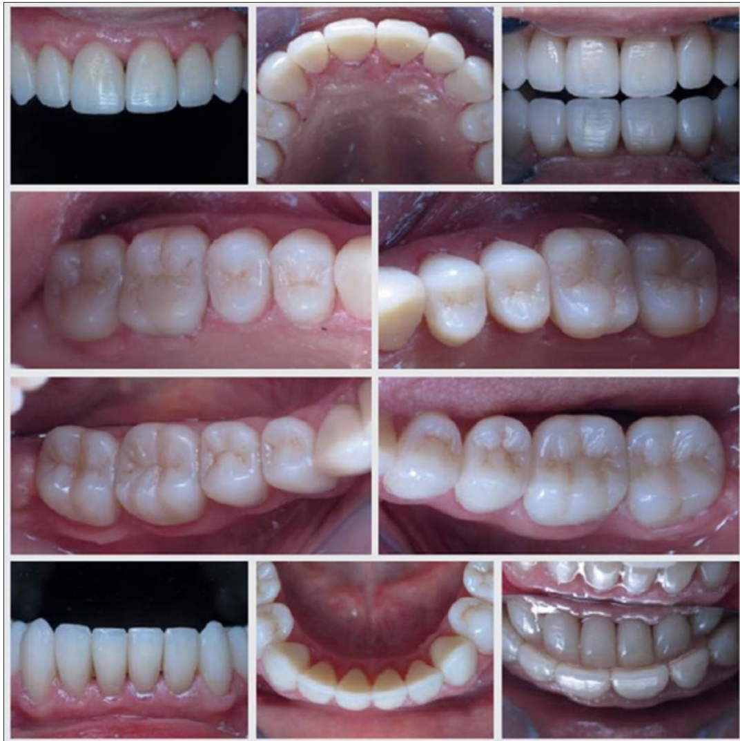
Figures 6: Composite Modeling of Teeth

A series of photos, identical to the wax-up photos, shows the immediate results of a direct tooth restoration, performed along spatial guidelines, such as the tooth cervix and dentinoenamel junction, exposed after removal of previous restorations. Thanks to open spatial guidelines, these restorations made in free technique without using templates!