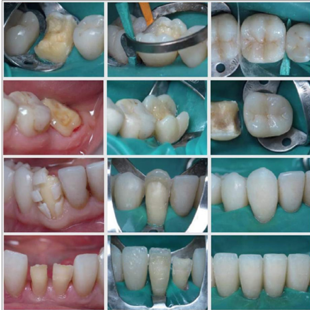
Figures 8: Replacement of Restorations in The Lower Teeth

Examples of the use of spatial guidelines when replacing restorations in lower teeth. The cervical contour of the tooth, the oral surface of the outer enamel together with the preserved height were used as guidelines during the reconstruction of the crown of tooth 46 oral cusps, as well as the contour of the vestibular crown surfaces of adjacent teeth. When constructing the contact surfaces, asymmetry was ensured by vertically installed wedges of different sizes (the contact point should be located vestibular).