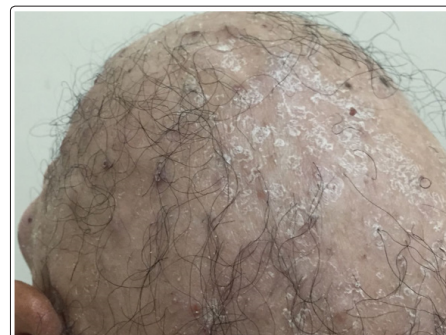
Figure 1: Patient scalp with severe alopecia and squamous lesions

Physical examination revealed well-demarcated annular erythematous scaly plaques with 2-4 cm multiple nodules on scalp (Figure 1) and trunk (Figure 2). Some nodules were ulcerated with