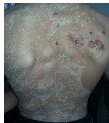
Figure 2: Erythematous scaly plaques and purulent nodules on the trunk