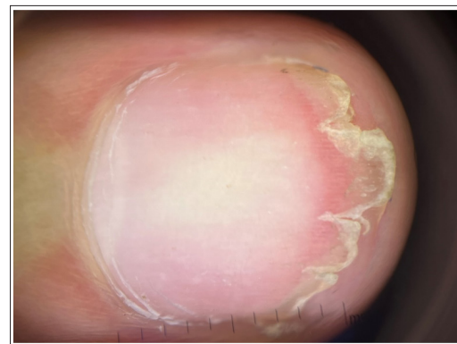
Figure 2: On onychoscopy, distal detachment of the nail plate is observed