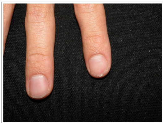
Figure 3: Onychoschizia is observed on the second finger of the right hand