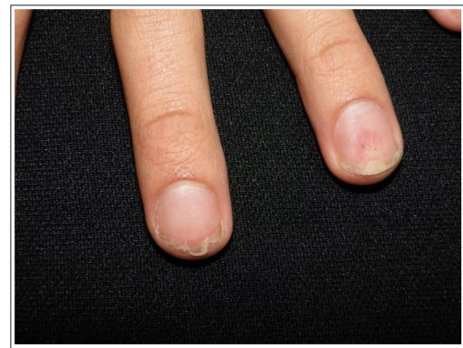
Figure 1: Separation of the distal edge of the nail on the third finger of the left hand (onychoschizia) is observed, associated with leukonychia and splinter hemorrhage on the nail plate of the fourth finger of the same hand.

A 24-year-old male from La Paz, Bolivia, with a history of nodulocystic acne, was undergoing treatment with isotretinoin 40 mg/day. After two months, he reported brittle nails. He denied any trauma, manual labor, or systemic diseases such as psoriasis. Dermatological examination revealed onychoschizia on the third finger of the left hand, the second finger of the right hand, and leukonychia with a few splinter hemorrhages on the fourth finger of the left hand (Figures 1-4). The full course of isotretinoin treatment was completed, and after 4 to 6 months, the nails returned to normal appearance.