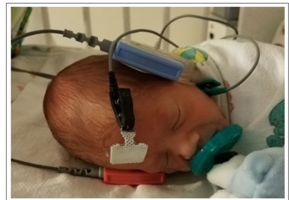
Figure 2: Neonatal Hearing Screening

Methods and Materials: The clinical observation sheets of the patients in the Republican Center of Audiology, Hearing Prosthetics and Pedagogical Rehabilitation served as study materials. 245 patients with unilateral deafness were selected. The age of the patients varied between 5 months and 17 years.