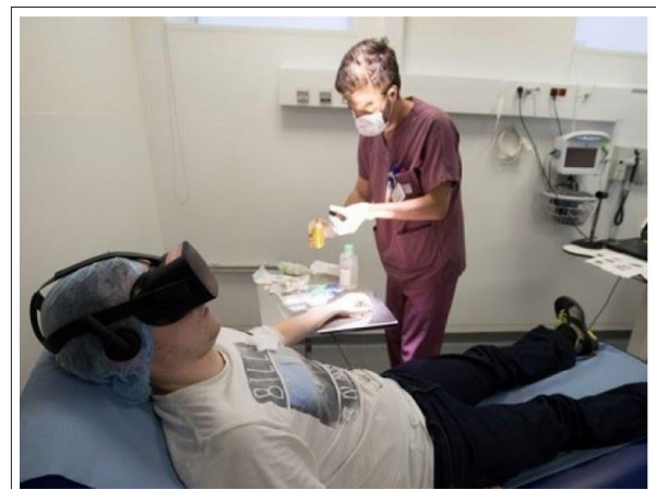
Figure 2: Virtual Reality for Pain Relief in Hospitals Huff post Canada 2021

Almost half of hospital patients experience pain, a quarter of which is considered "un-bearable" [4]. The treatment of pain has traditionally been based on pharmacological management, including opioids, which can give inconsistent and suboptimal results. Therapeutic virtual reality (VR) has become an effective and non-pharmacological treatment modality for pain [4, 5]. VR users wear a head-mounted display with a proximity screen that creates a feeling of being transported to realistic three-dimensional worlds (Figure. 1-2).