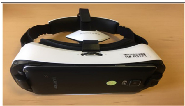
Figure 1: VR Virtual Reality Headset

VR refers to the interactions between an individual and a computer-generated environment stimulating multiple sensory modalities, including visual, or auditory experiences. The user's perception of reality is facilitated by the use of headsets (HMD, in glasses or helmets), (Figure-1).