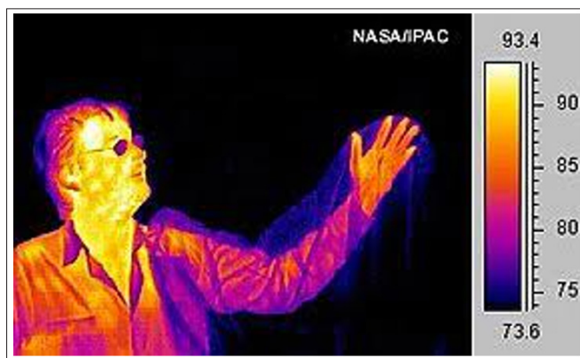
Figure 1: Shows that Humans Emit Infrared Energy with the Average Wavelength of 10 Microns. Temperature Scale is in Degrees Fahrenheit.

Multi-vitamins and minerals found in all foods play an important role in helping to regulate the body's many processes and functions (Homeostasis). They can help monitor the balance between cell growth and cell death, particularly between cancer cell growth and cancer cell death and many other diseases. Continuing research over the years has shown that the loss of several vitamins and minerals can contribute to uncontrolled cancer cell growth and that, conversely, increased ingestion through foods or supplementation can slow the development and/or progression of diseases.