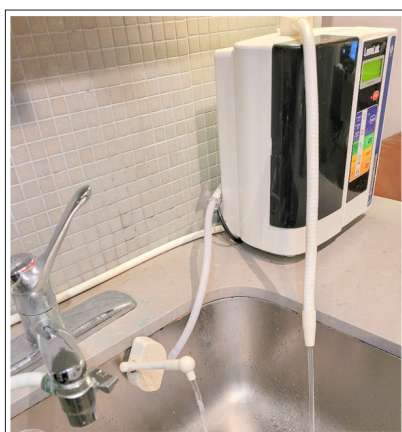
Figure 5: Enagic Corporation's Leveluk SD501 (Cost: 3,980 US) Used by the Donyina Family (Price Range: JR II to K8; $2,380 to $4,980 US with Platinum Electrodes) Distributor ID: 1418834

Vital Water. Left: Acidic water (pH 4.5) Right: Vital Water (pH 9.5). Natural hot spring water has the same healing properties as Vital Water. Hydrogen-rich micros-clustered alkaline water has several beneficial effects on the human immune system.