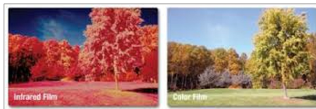
Figure 2: Infrared Film Showing Absorption of Infrared during Photosynthesis.

https://www.google.com/url?sa=i&url=https%3A%2F%2Fen.wikipedia.org%2Fwiki%2FBlack-body_radiation&psig=AOvVaw18Qmk-UDageGz_9N_L_&ust=1645697529770000&source=images&cd=vfe&ved=2ahUKEwiUotCWy5X2AhWIK98KHeVRCpUQr4kDegUIARDiAQ