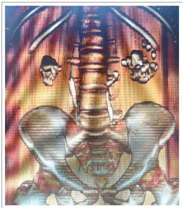
Figure 1: Both Kidneys had Staghorn-Shaped Stones and Multiple Stones in Both Ureters