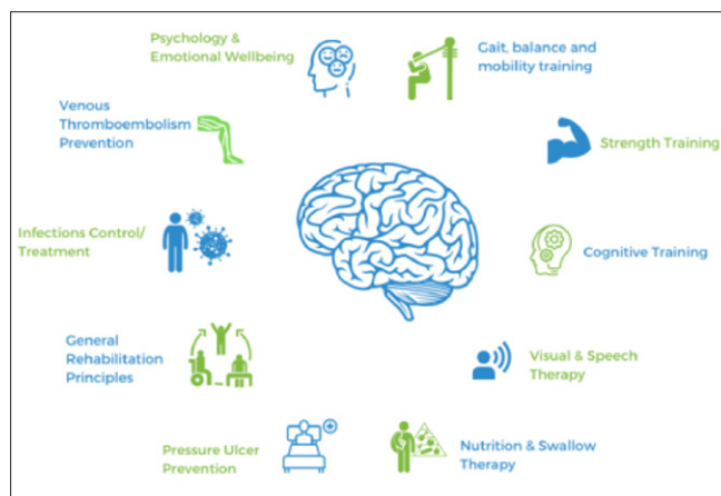
Figure 3: Comprehensive Stroke Rehabilitation

remain a major challenge, especially where financial resources are scarce. Furthermore, depending on the intervention, time or task constraints may be an issue. For instance, therapies like CIMT or robotic-assisted interventions are intensive and could be taxing on the patient.