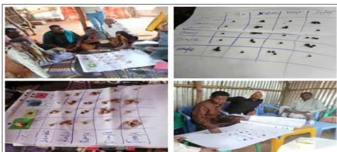
Figure 3: Grouped Images of Livestock Diseases Seasonal Ranking in FGDs (Bodeley, Kabridahar, kudunbur, Galhamur)