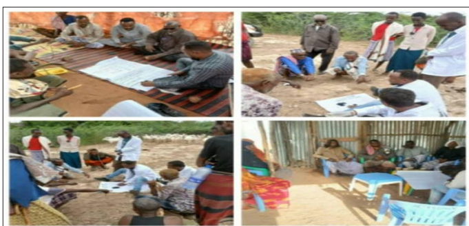
Figure 2: Grouped Images of Proportional Piling, Pairwise Ranking and Matrix Score in FGDs in Study Areas (Bodeley, Kabridahar, kudunbur, Danod and Galhamur)

From 15 major livestock diseases listed by participants through simple ranking method, Similarly, proportional piling method were employed using focus groups across the selected five study districts. Participants were asked to allocate a total of 100 stones or beads based on the perceived relative frequency and impact of major livestock diseases affecting their livestock populations. Thus, the results of the proportional piling of 15 livestock diseases listed were summarized in below (table 2), revealing that Contagious Caprine Pleuropneumonia (CCPP) was the most frequently reported disease, accounting for 14.2% , followed by Peste des Petits Ruminants (PPR) (13.0%) , Hemorrhagic