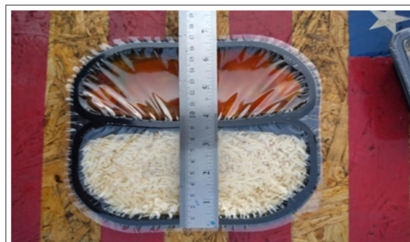
Figure 1: Polymeric Container Type C-PET Two-Section

The object of research is a two-section polymer C-PET container, which consists of a polymer semi-rigid tray made of heat-resistant multilayer PET / EVOH / CPP and multilayer polyethylene film S900775 PET / PE (for sealing containers). Packaging capacity - 350 g. The type of packaging is shown in fig. 1.