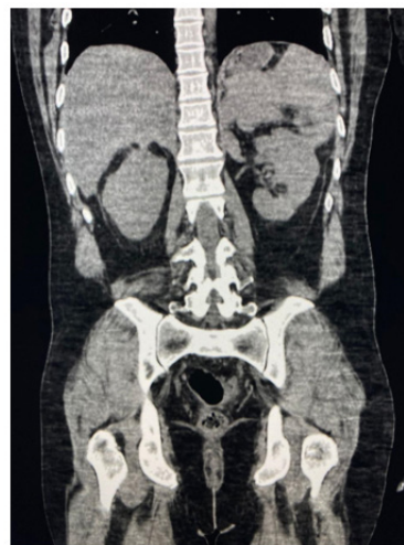
Figure 1: Computed Tomography of the Abdomen Showing Bilateral Adrenal Masses

Laparoscopic adrenalectomy is the standard of care for most adrenal tumors, although the procedure can be technically challenging for large masses, which is why an open approach was preferred in this case [12].