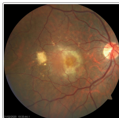
Figure 2a: Fundus photography of resistant n-AMD

Macular Degeneration Treatments Trials Research Group reported that 51.5% of eyes treated with ranibizumab and 67.4% of eyes receiving bevacizumab had persistent exudation demonstrate by optical coherence tomography (OCT) despite monthly intravitreal (IV) injection for two years. (15) Heier et al. showed that 19.7%–36.6% of eyes had evidence of persistent fluid demonstrated on either fluorescein angiography or OCT despite 4 or 8 weekly regular aflibercept injections after one year treatment period [34]. The resistance may occur in every treatment regimes with different anti-VEGF agents. Therefore distinguish between resistance to anti-VEGF therapy” and “resistance to anti-VEGF agents” is essential because some eyes seem to be resistant may respond to different anti-VEGF agents. (figure 2a, Figure 2b)