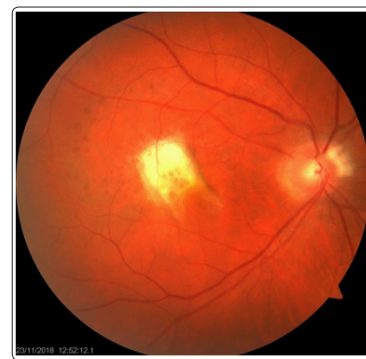
Figure 1a: Fundus photography of Fibrous scar due to neovascular Age-related macular degeneration (n-AMD)

Vascular Endothelial Growth factors (VEGF) play a crucial rule in the development of Choroidal neovascular membrane (CNV), the hallmark of n-AMD. Nowadays, Anti-VEGF therapy is the gold standard treatment in n-AMD. If these aberrantly growing immature vascular structures do not treat, they typically leak exudates, bleeds, and finally, fibrous scar develops. In addition to VEGF, many other proangiogenic factors such as platelet-derived growth factor (PDGF) placental GF (PGF), fibroblast GF (FGF), transforming GF (TGF), interleukins, tumor necrosis factor play an essential role in the development of CNM. The increased expression of these factors during antiangiogenic monotherapy may stimulate other alternative VEGF-independent angiogenesis pathways. Therefore persistence or recurrence of