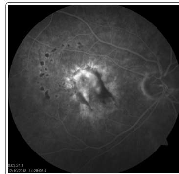
Figure 1b: Fibrous scar due to n-AMD evaluated by fluorescence angiography (FFA)